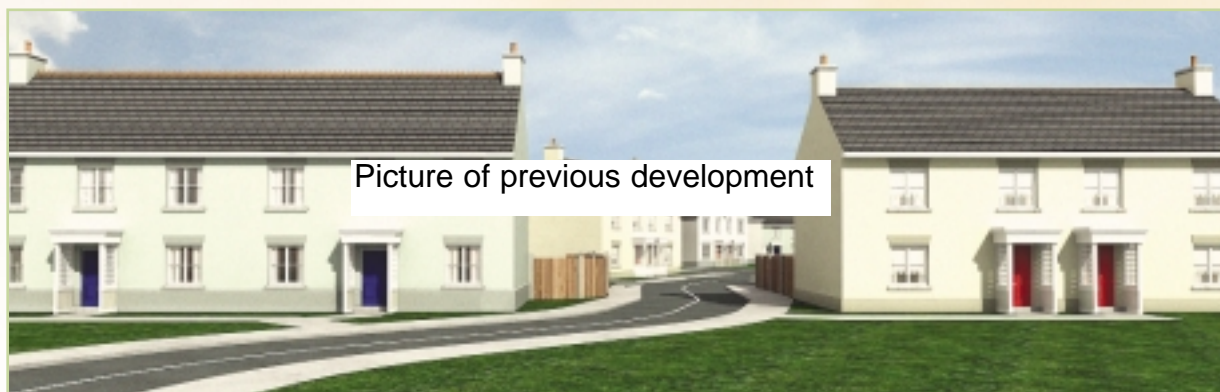
Development1: Pic of a TJ Gaughan development here.

T.J. Gaughan Construction Company are specialist home builders who concentrate on quality instead of quantity. This family run construction company take pride in the level of finish to their developments. That when people move into their new house they are setting up home. T.J. Gaughan ensure that all the houses are completed prior to move in and that the common are landscaped and all paths and roads into the development are finished. T.J. Gaughan Construction guarantee customer satisfaction