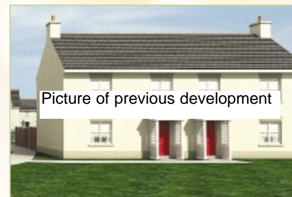
Development 4: Pic of a TJ Gaughan development here.