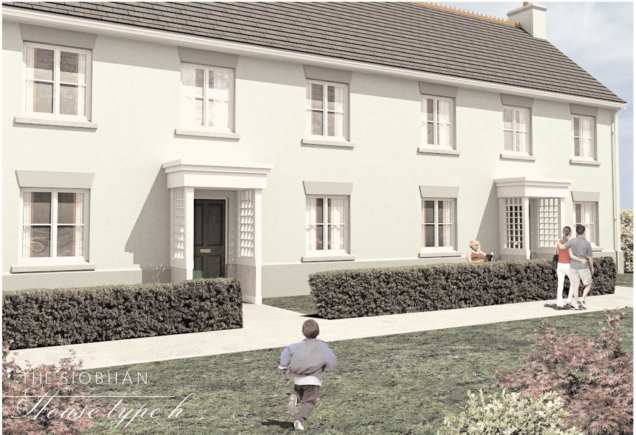
THE SIOBHÁN House type h